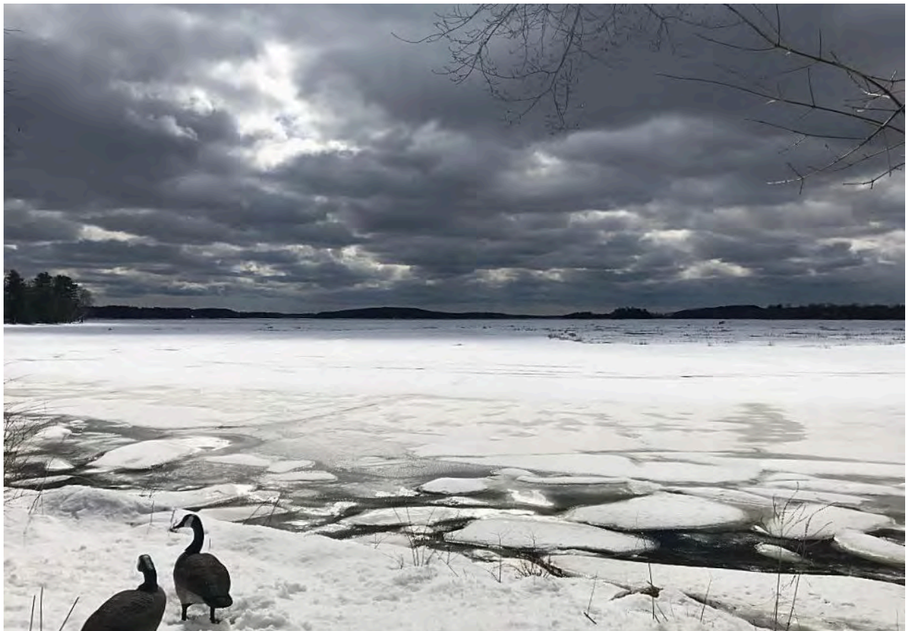
Abbagadassett River Mouth

Printed on Genesis Writing. 100% Recycled, 100% post-consumer waste, processed chlorine-free.